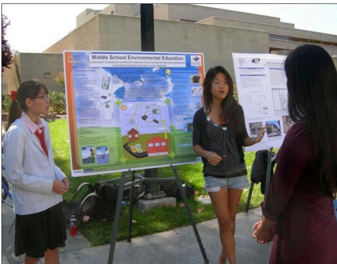
TIES Project - Middle School Environmental Education

The benefits for student's involvement in TIES are numerous, and include improved communication, organizational, and leadership skills, start-to-finish design experience, multidisciplinary teamwork, experience in project and resource management, ethics training and responsibility, as well as customer and community awareness. Finally, TIES provides demonstrable and measurable outcomes of undergraduate engineering theoretical knowledge, technical skills, teamwork, communication, ethical responsibility and value for professional development. MAE students are eligible to receive 4 units of technical elective.